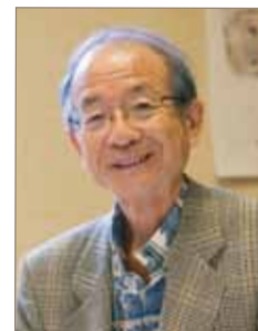
Ikujiro Nonaka, Ph.D.