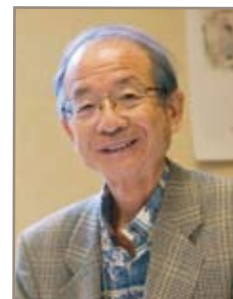
Ikujiro Nonaka, Ph.D.